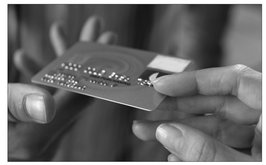
Business Services accepts Visa, MasterCard and American Express.

Persons who have outstanding indebtedness to OSU-Oklahoma City, including students with the Deferred Payment Plan, are not allowed to register, receive a transcript of record or receive a diploma until such indebtedness is satisfactorily cleared with Business Services.